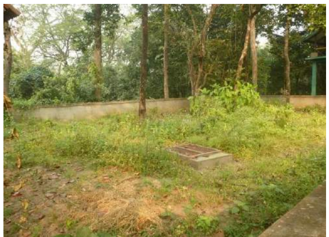
Views of terrestrial enclosure and newly converted aquatic habitats, below.