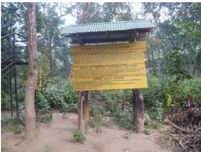
Information board about turtles