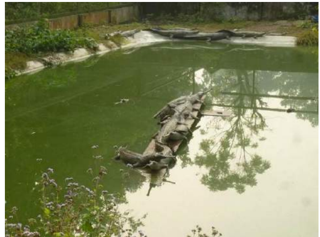
Converted pond without interference