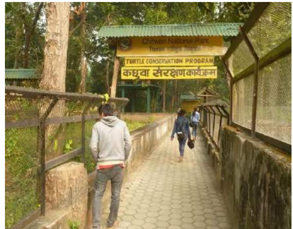
Entrance gates to the Breeding stations

Now, the turtle section has also been renovated and I heard about a new concept being implemented there. Bed Khadka Sir has converted two ponds without partition; one is natural without any interference and another one will be controlled by timely cleaning. He has also kept juvenile gharials in sympatry with terrapins. But unfortunately due to cold weather and cryptic nature of turtles, not a single one could be observed.