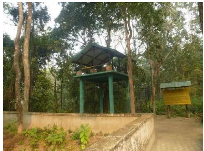
A balcony for viewing in turtle section

During the initial presentation Bed Sir also briefed about contribution of Prof. Schleich / ARCO-Nepal and TRCC of Budoholi which was very encouraging to students and me as well.