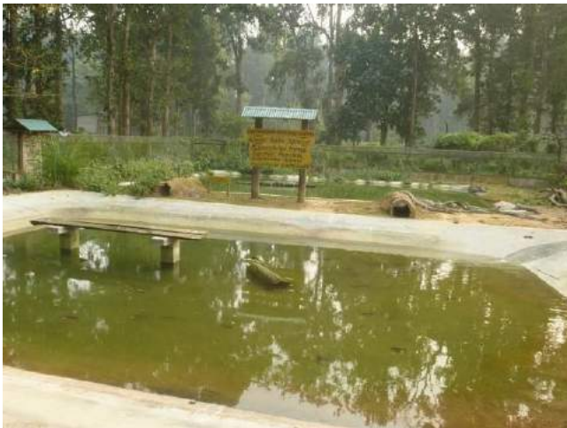
Pond with interference or cleaning